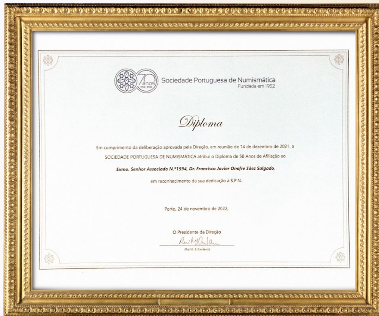
Sociedade Portuguesa de Numismática Diploma de 50 Anos de Afiliação