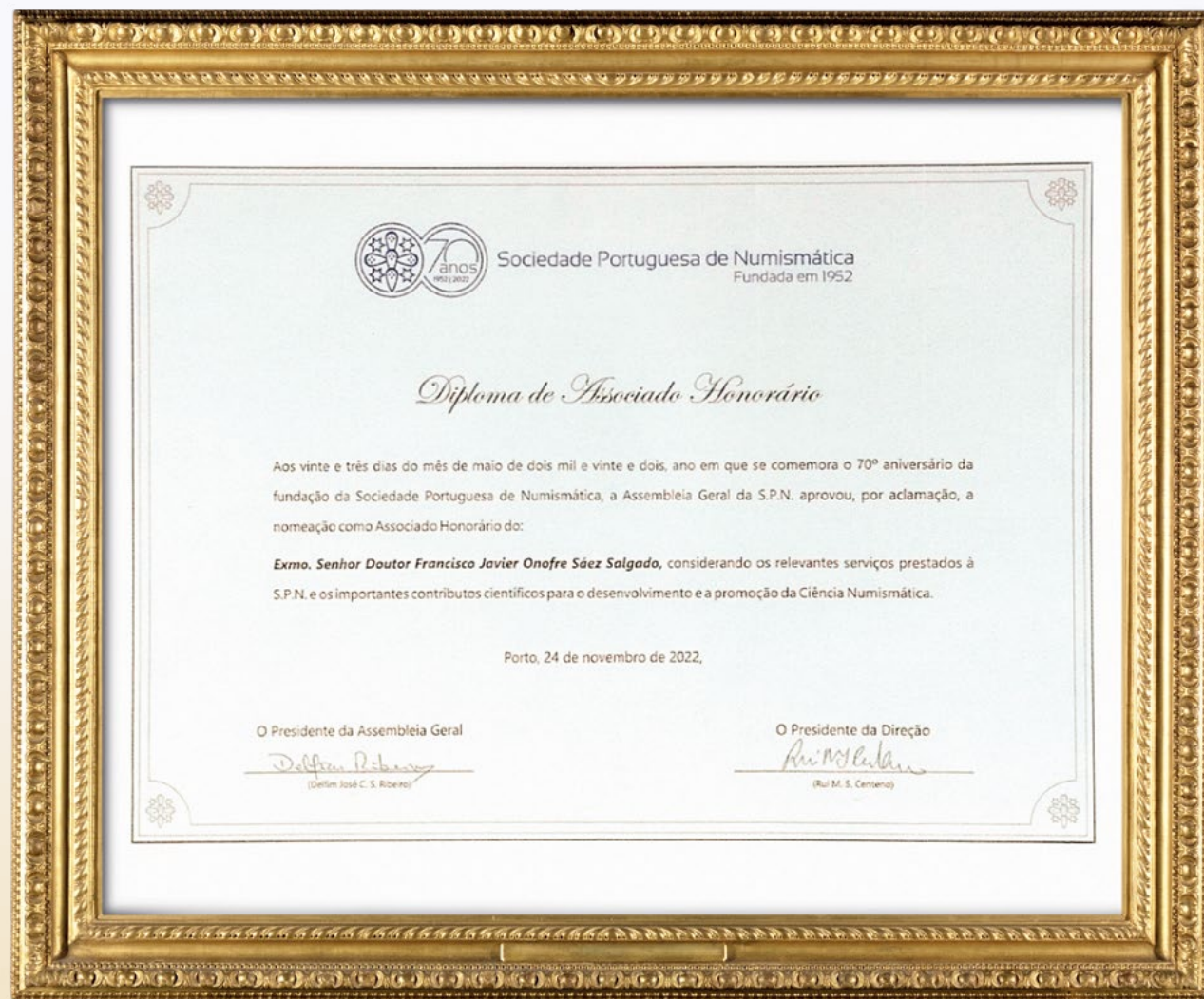
Sociedade Portuguesa de Numismática Diploma de Associado Honorário